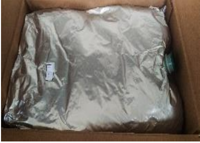
Metalized Polyester Laminated Aseptic bag