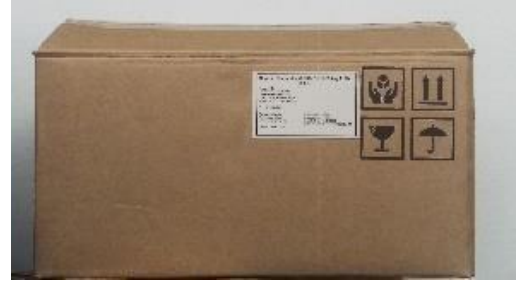
5 Ply corrugated craft paper carton

(Length 275mm * Width 275 mm * Height 390 mm)