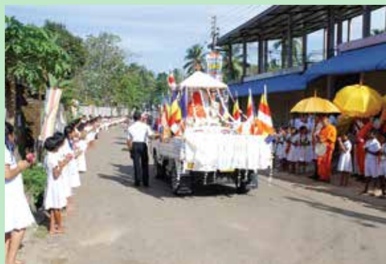
Shrine room for Katukenda Sri Sangabodi Central College