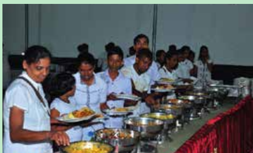
Annual Pirith Ceremony and almsgiving for provide religious background and improve mental health of employees