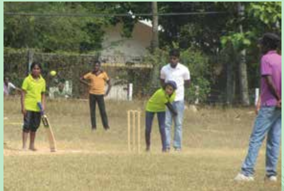
Annual Cricket match organized by Jaindi Export (Pvt.) Lt.