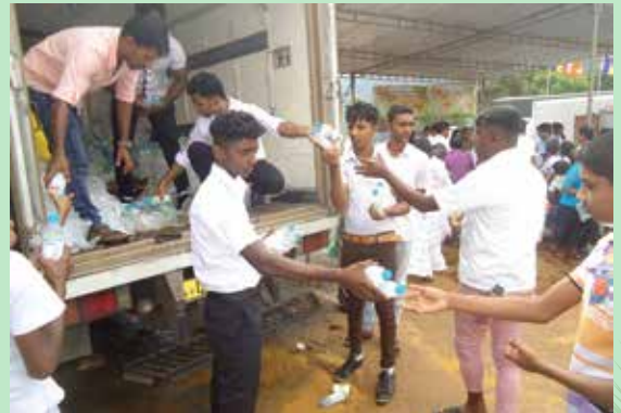
Beverages to "Mahaveli Maha Seya" Opening Program