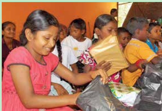
Thanthirimala alms giving for low income Children