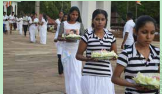
Religious activities, "Anuradhapura"