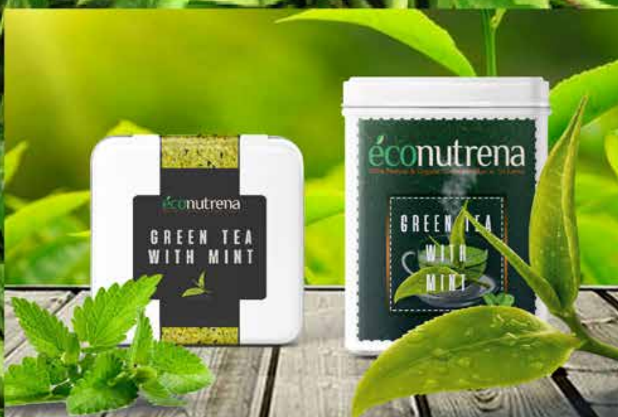
GREEN TEA WITH MINT