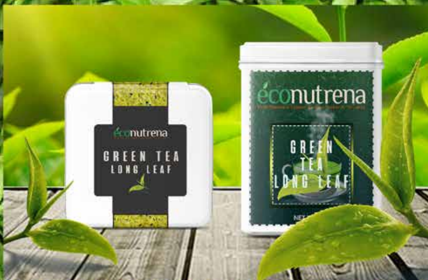
GREEN TEA LONG LEAF