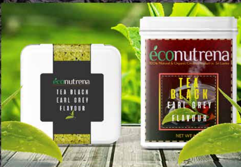
BLACK TEA EARL GREY FLAVOURED