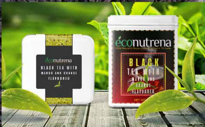
BLACK TEA WITH MANGO AND ORANGE FLAVOURED