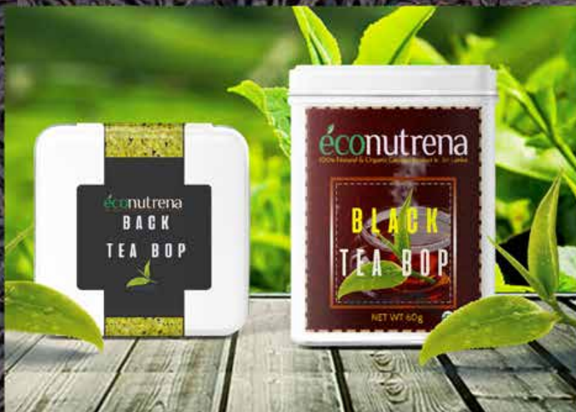
BLACK TEA BOP