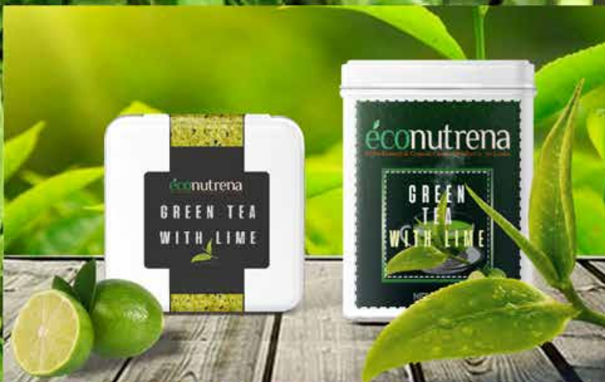
GREEN TEA WITH LIME